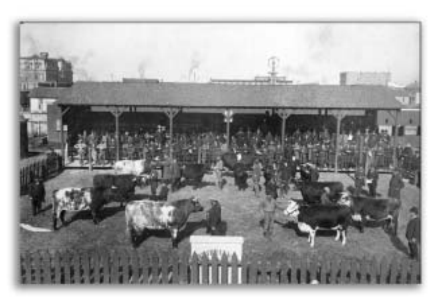
An auction at the Kansas City stockyards, ca. 1900.