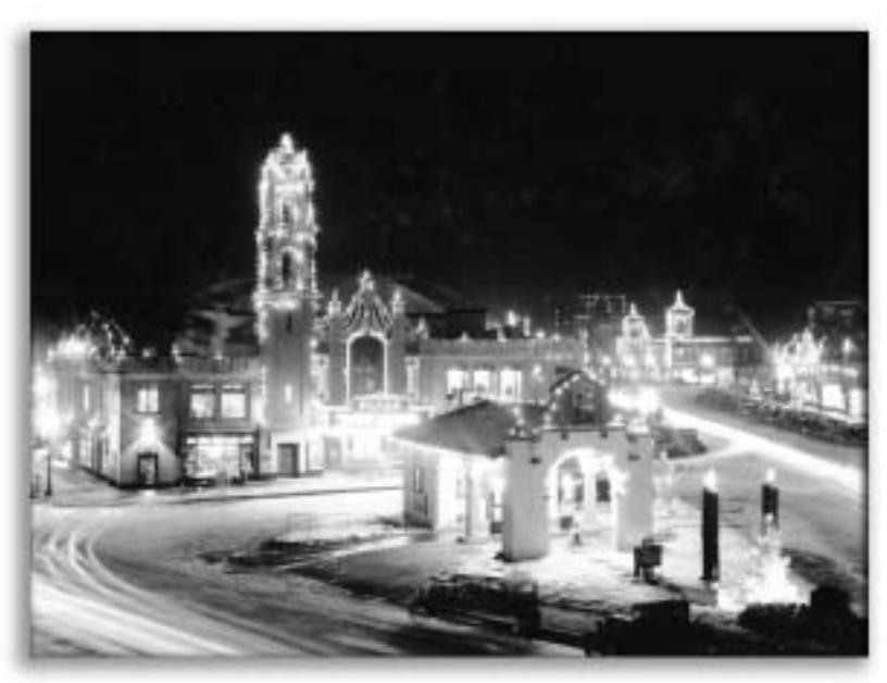
The famous Country Club Plaza Lights, ca. 1930.