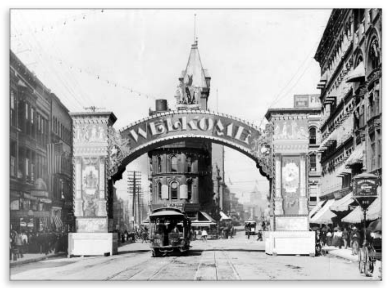
Kansas City welcomes the annual Priest of Pallas Parade, ca. 1895.