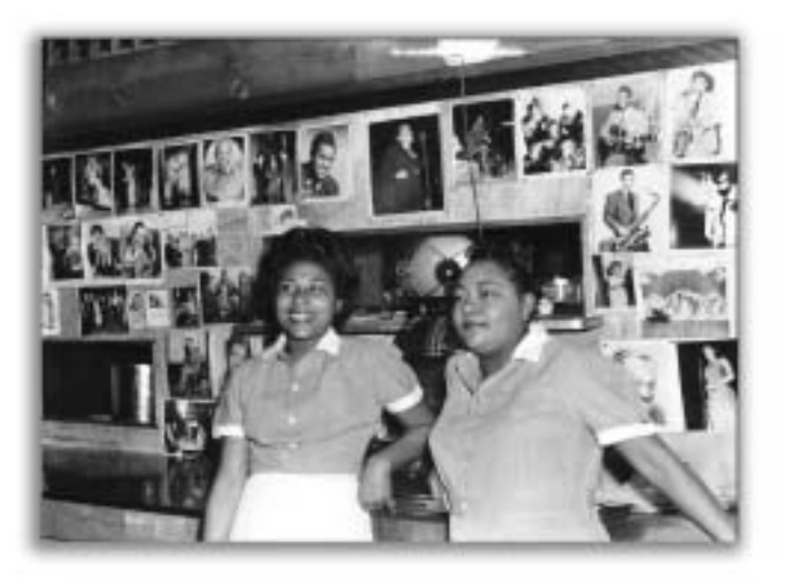
One of Kansas City's many barbeque restaurants, ca. 1960.