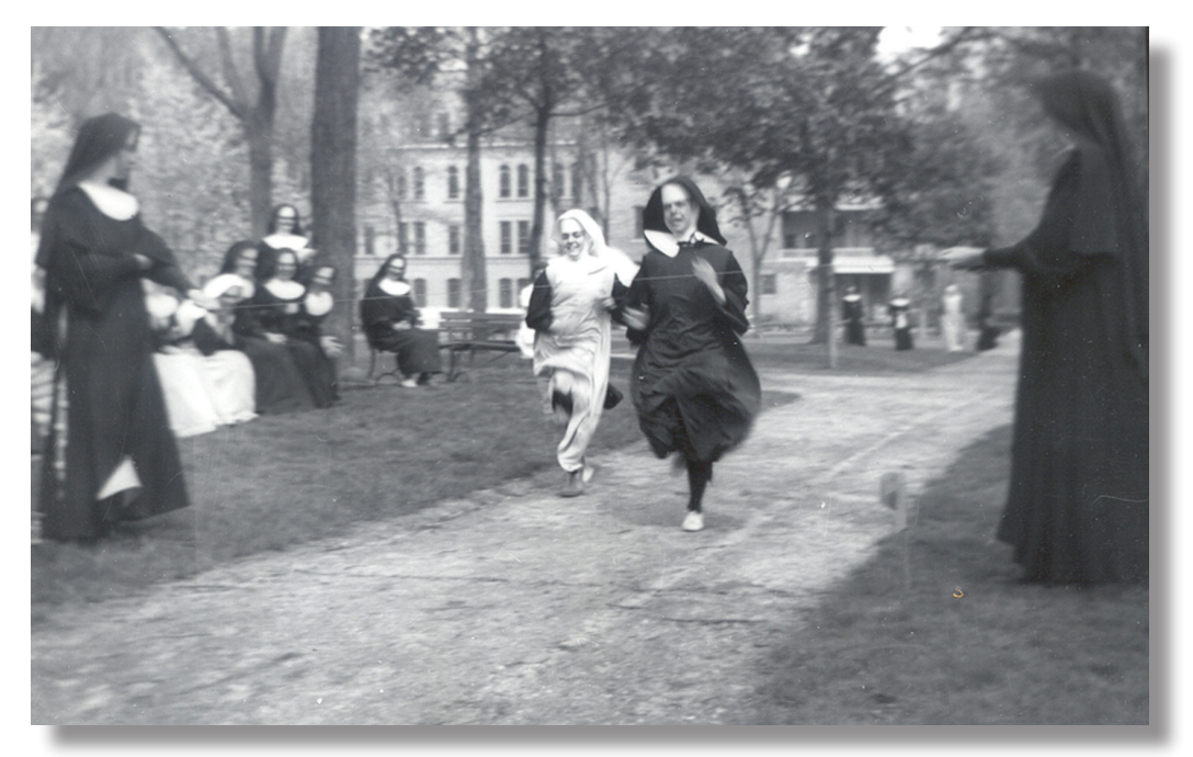
Two nuns running the 50-yard dash as a part of the fourth annual Alverno College Field Day held on the grounds of St. Joseph Convent, Milwaukee, Wisconsin, May 1949.

Fee: $50.00. Enrollment is limited. Advance registration is required.