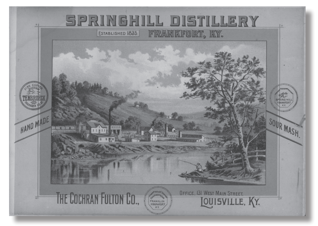
The Springhill (or Spring Hill) Distillery was founded in Frankfort, Kentucky, in 1835, and operated until it was converted to a chair factory after Prohibition. This advertisement was taken from the illustrated program for the Satellites of Mercury parade in Louisville, Kentucky, October 4, 1889.