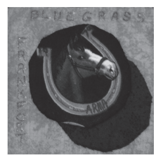
Frankfort-Bluegrass ARMA Chapter