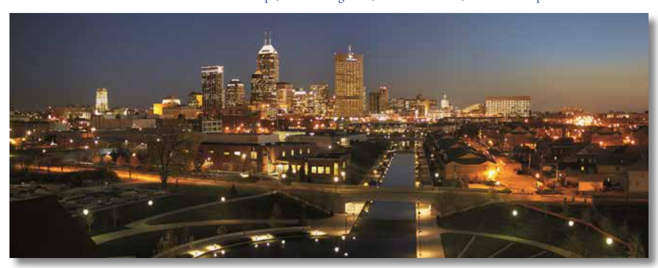
Indianapolis skyline with canal.

Before your visit (or even when you get to town), check out these two mobile apps: Visit Indy and Indy Downtown, available for both iPhone and Android devices. Both offer interactive maps, restaurant guides, local attractions, and even coupons and discounts.