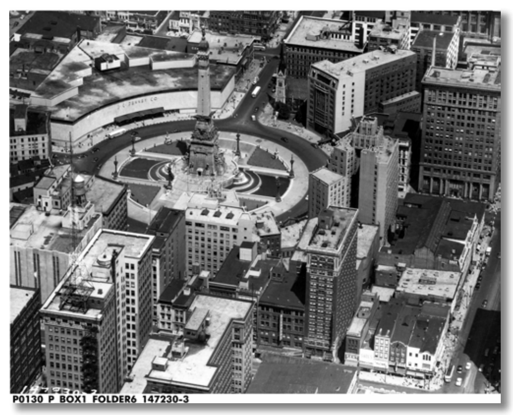
Monument Circle, aerial view, ca. 1960s.