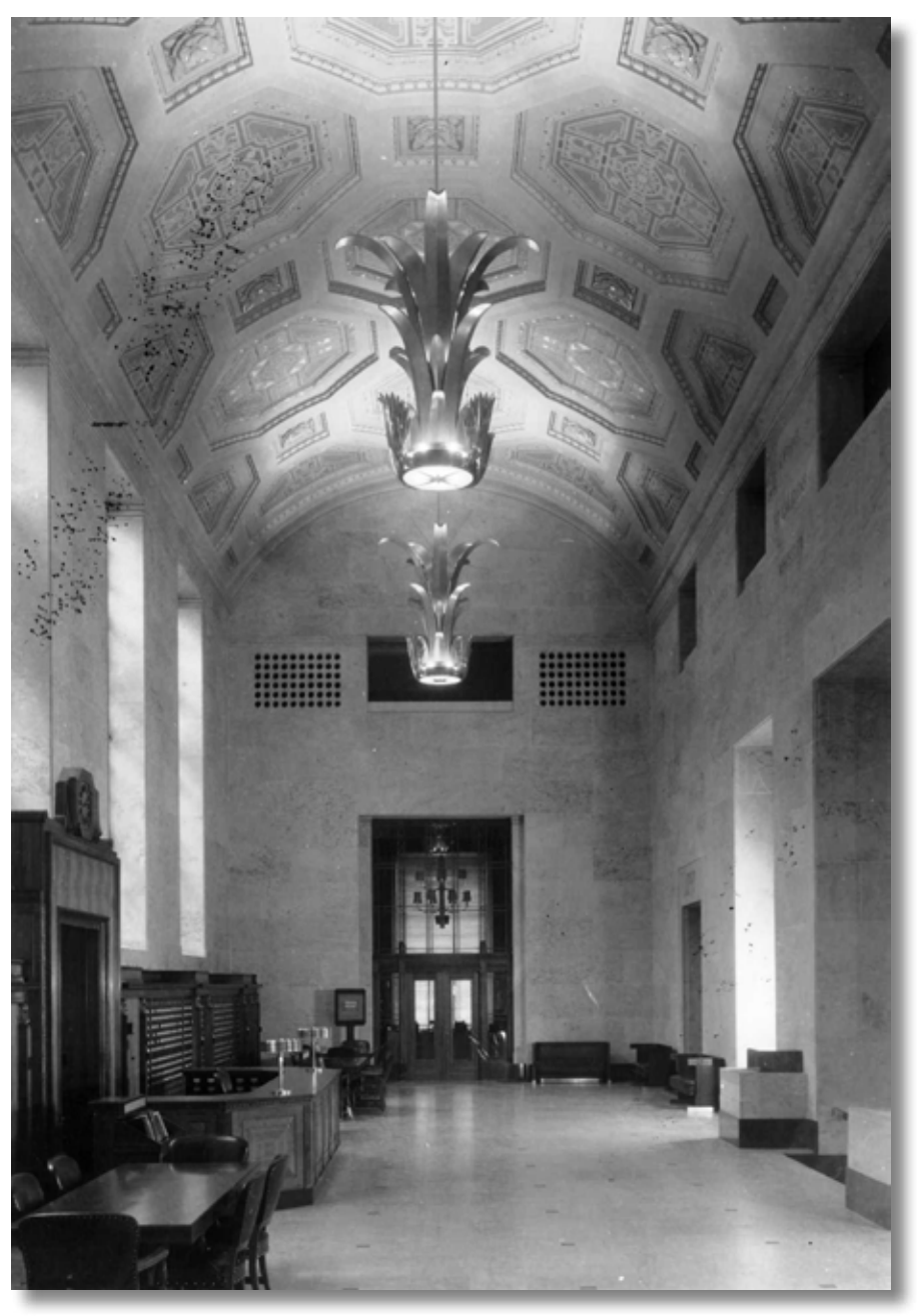
Indiana State Library interior photograph, ca. 1950s.