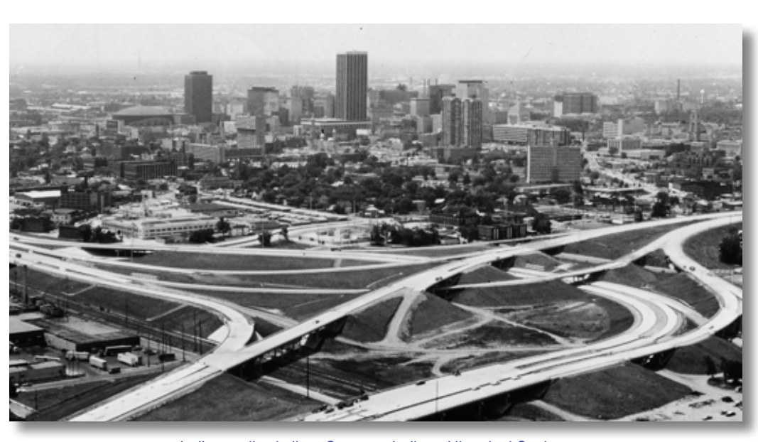
Indianapolis skyline.

This year's student poster sessions will offer attendees the opportunity to see projects and research conducted by our next generation of archivists. Students will be on hand to discuss their work during the Friday afternoon break.