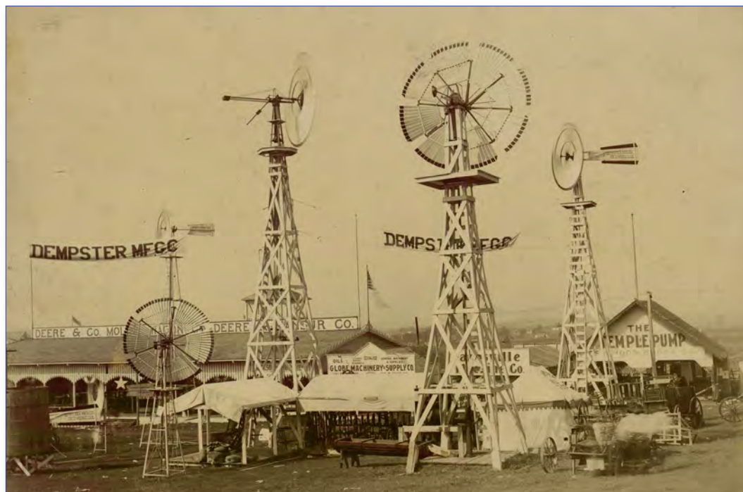
Dempster Manufacturing Company windmill display at the Iowa State Fair. Des Moines, Iowa. ca. 1910.