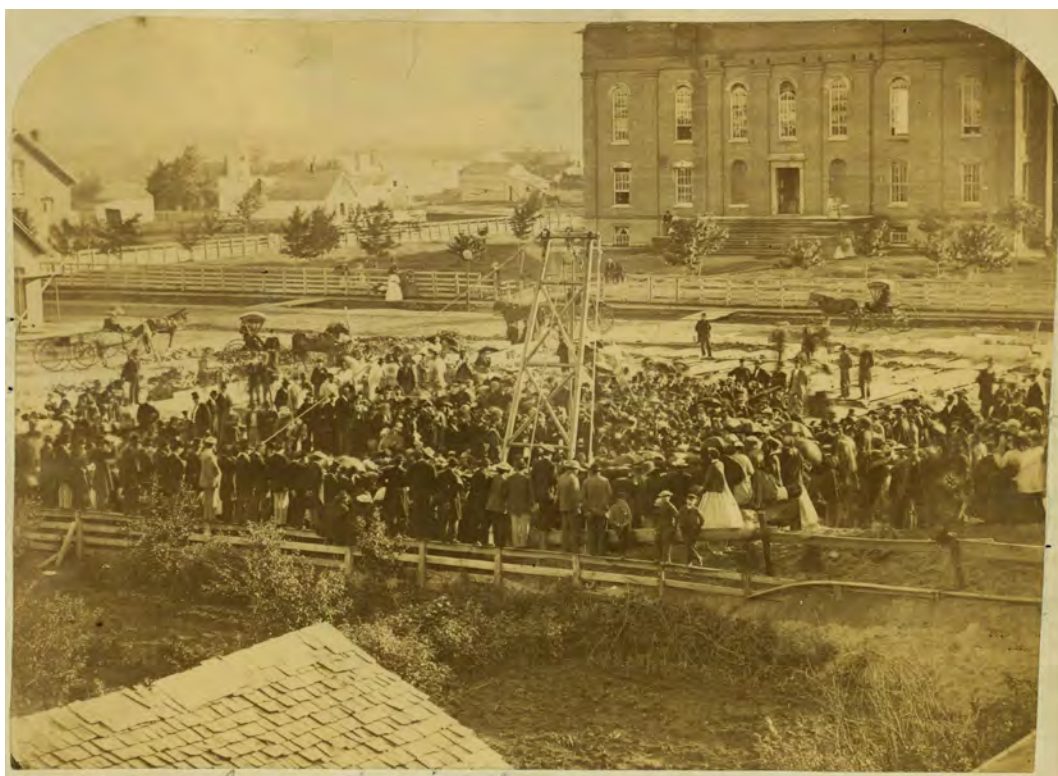
Crowd gathered at 5th Street and Court Avenue to witness laying of cornerstone for the U.S. Federal Building and Post Office. Des Moines, Iowa. 1868.