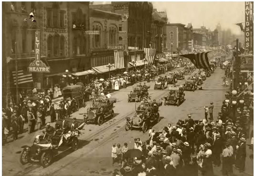
View looking east from 5th and Walnut Streets during parade honoring President William Taft. Des Moines, Iowa. ca. 1909.

Session type: Lightning Talk, LIVESTREAM