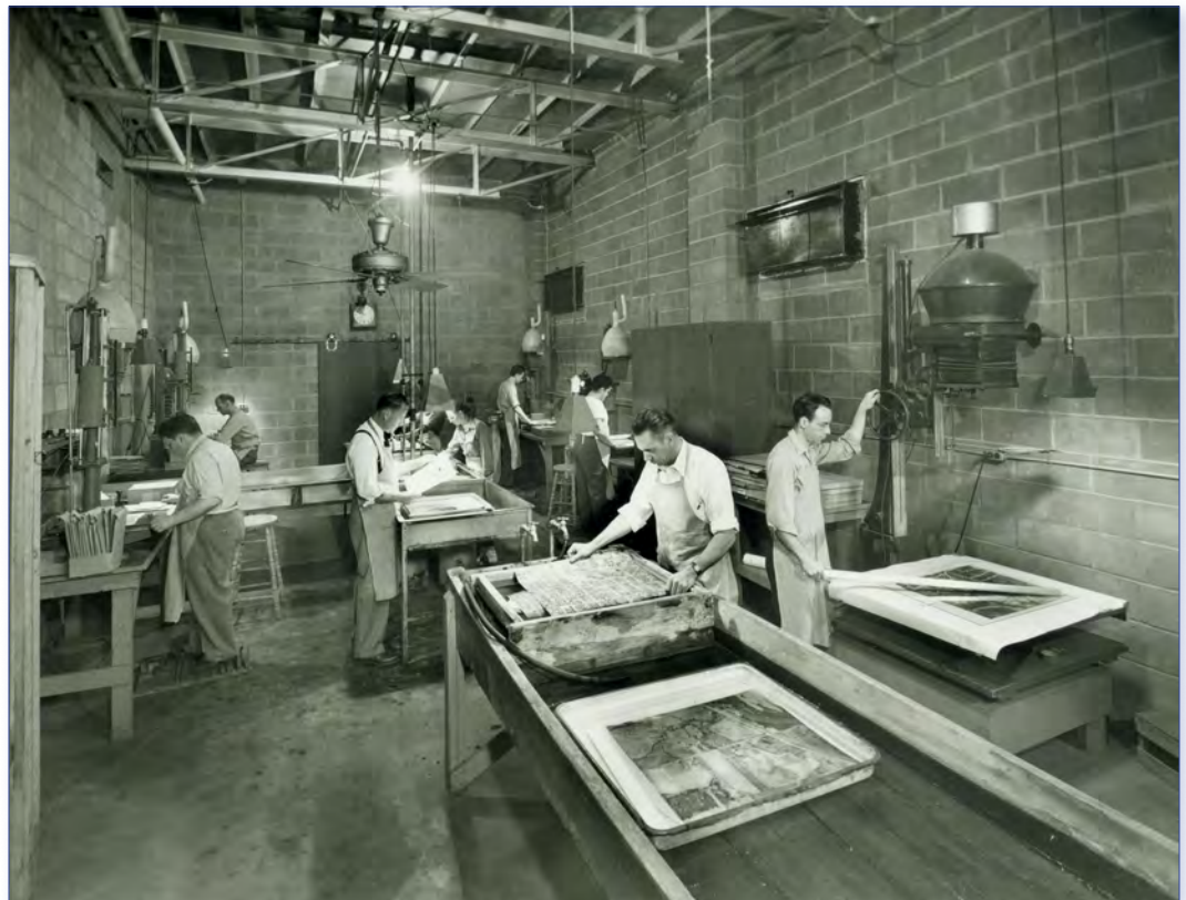
Aerial prints being processed at the Woltz Photography labs. Des Moines, Iowa. ca. 1947.