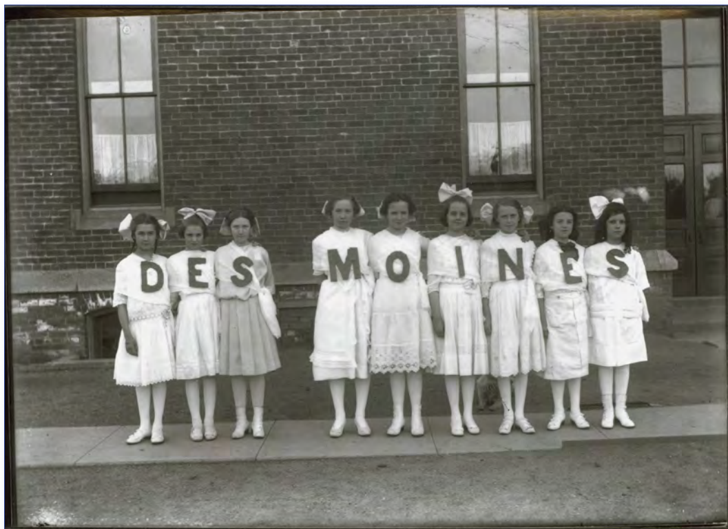
Nine girls wearing dresses with letters affixed spelling out "Des Moines." Des Moines, Iowa. ca. 1915.