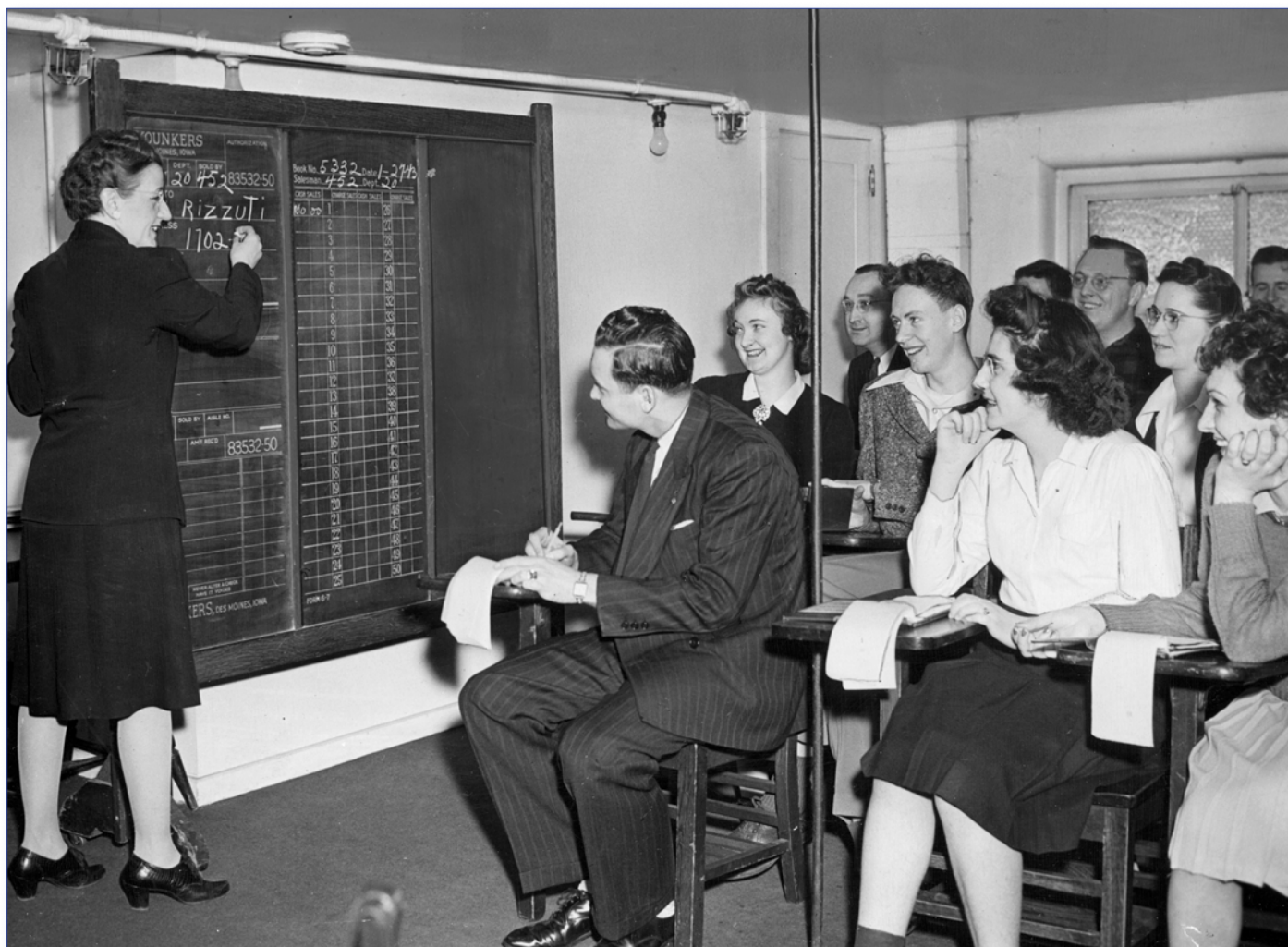
Training class for employees of Younkens department store. Des Moines, Iowa. ca. 1942.