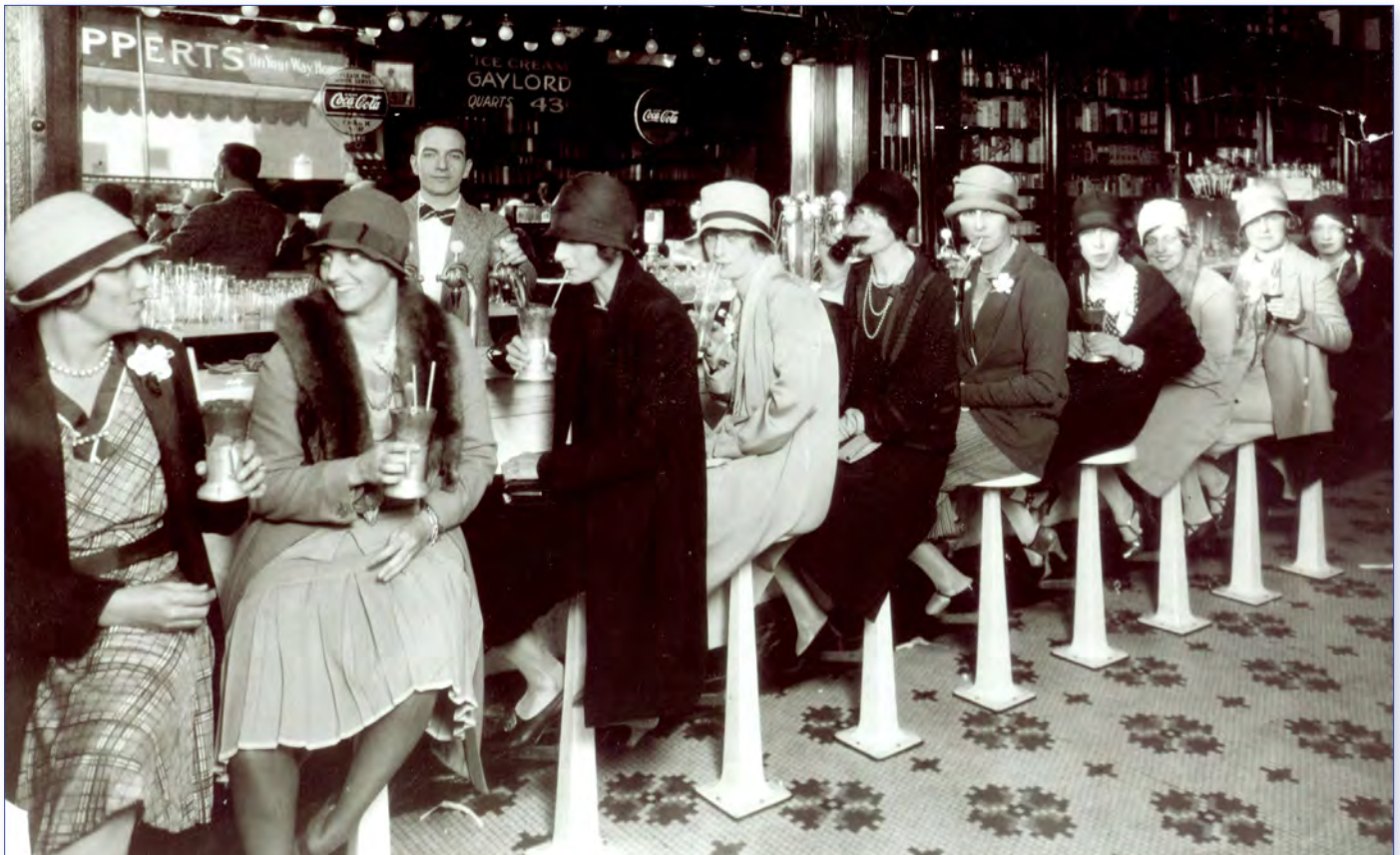
Women enjoying refreshments at the Reppert Pharmacy soda fountain. Des Moines, Iowa ca. 1925

MAC is also facilitating a “lunch buddy” program to connect members outside of sessions. Please see the Local Arrangements Blog for sign-up sheets.