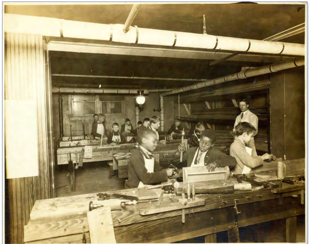
Boys in shop class at the Roadside Settlement House. Des Moines, Iowa. 1920s.