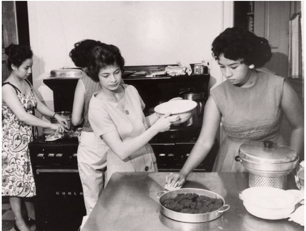
Photograph of a group of women cooking, possibly at the International Institute of Milwaukee. 1960 – 1969

Session type: Roundtable discussion (90 minutes)