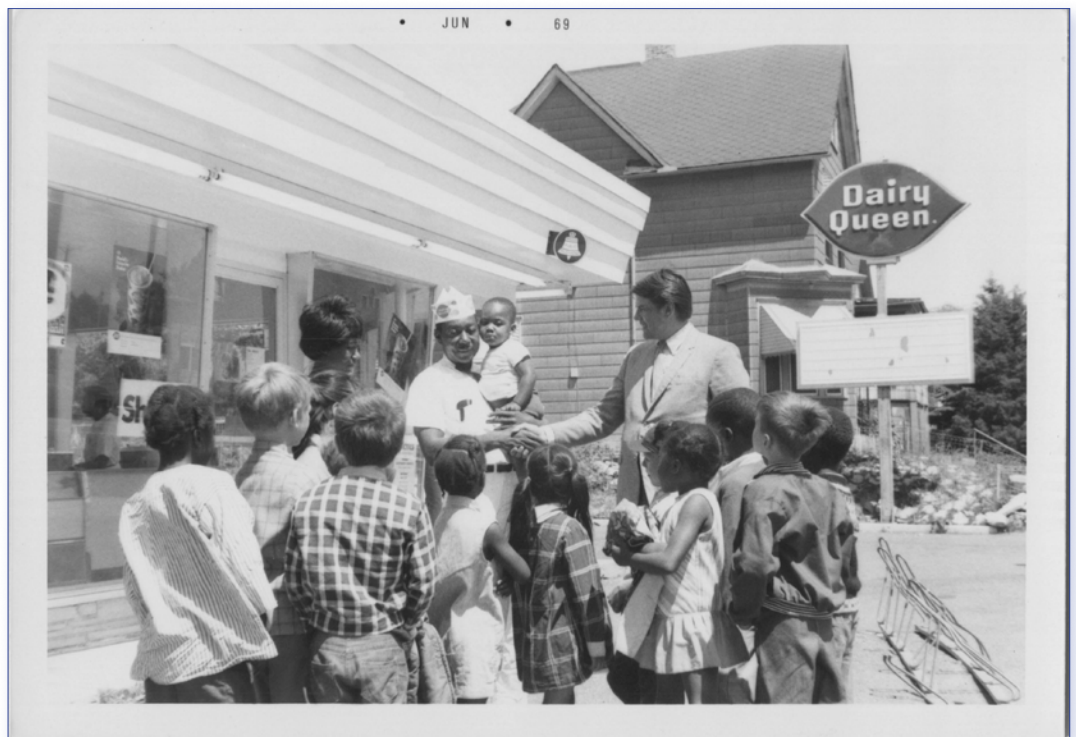
New Dairy Queen Owners. Hennepin County Library, 1969

Session type: Roundtable discussion (90 minutes)