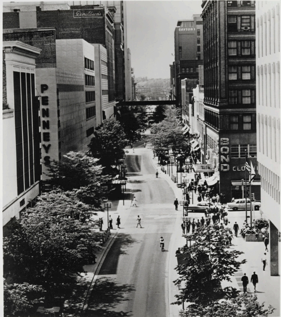
The eight-block long, tree-flanked Nicollet Mall in Minneapolis meanders through the heart of the city's prime retail area which includes scores of small shops, boutiques and five major department stores.