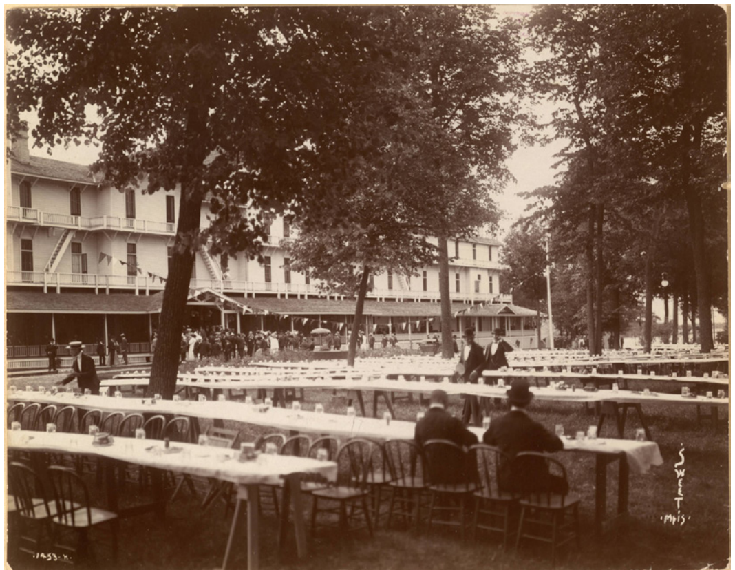
Tables set for an outdoor lunch at the Lake Park Hotel on Lake Minnetonka.

Session type: Roundtable discussion (60 minutes)