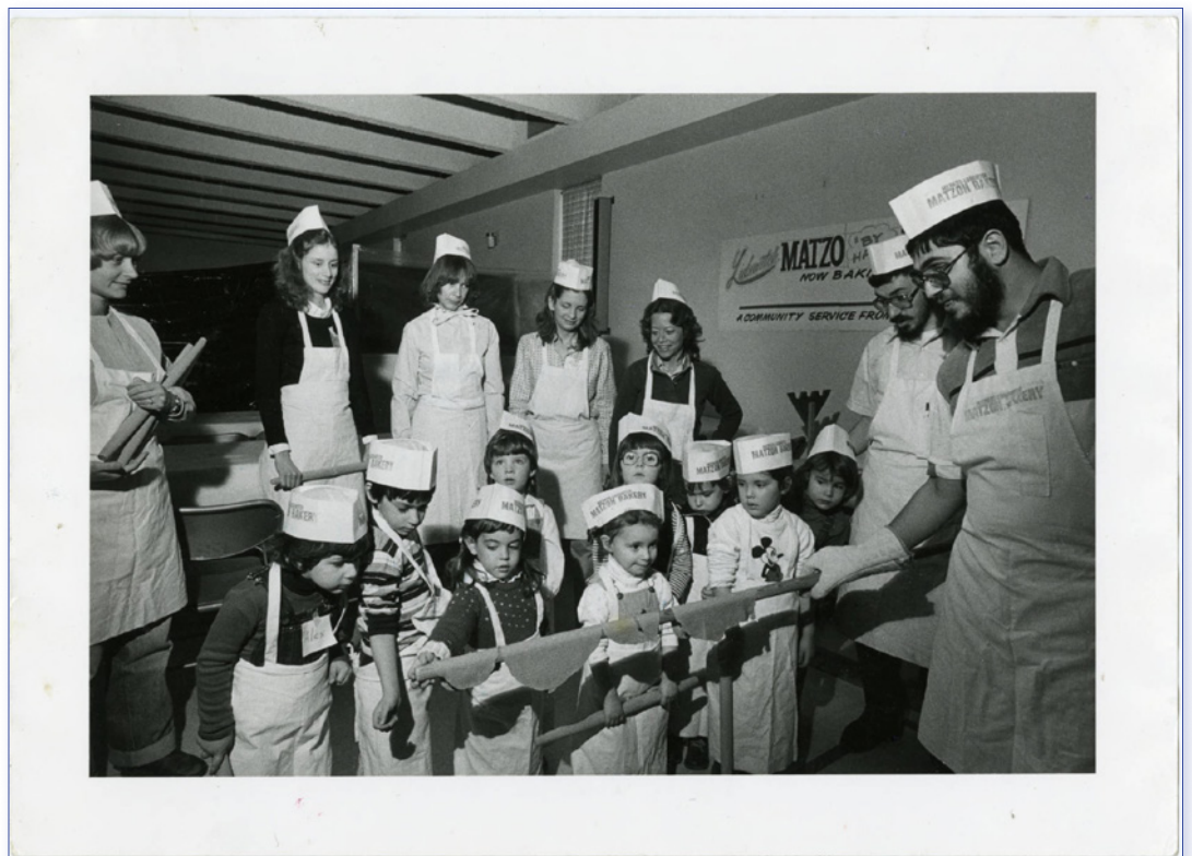
Group of children are shown making matzo before it is baked by a group of adult members of Lubavitch and Temple Israel synagogue at an annual baking event. Allen Schumeister, Photographer (Minneapolis, Minnesota), 1982