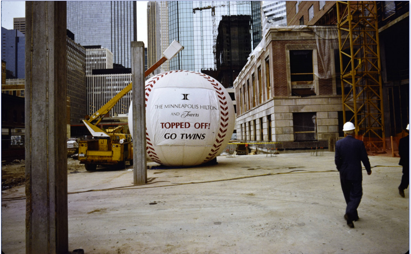
The topping off ceremony marks the completion of a building's framing during the construction process. Taken during the Minnesota Twins successful pennant year, 1991.