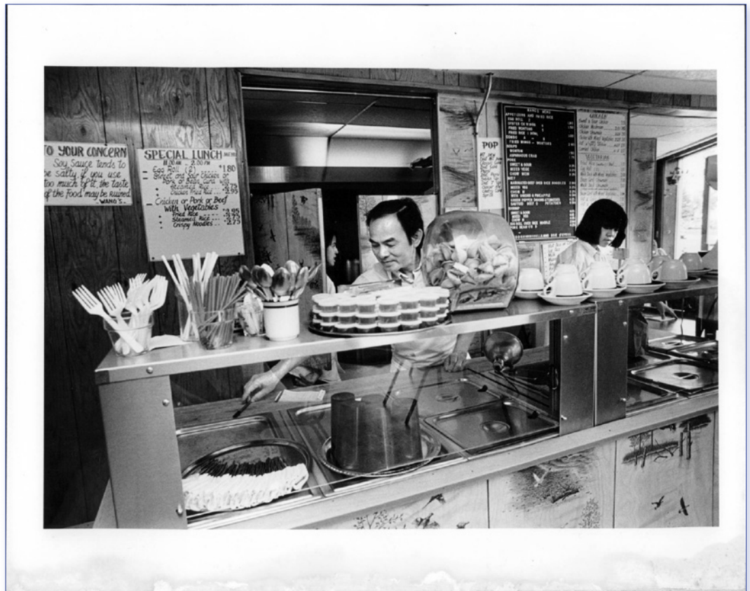
Wang's Vietnamese Cuisine. Part of a regular column on local restaurants: "Quality Dining on a Budget Buck," Hennepin County Library, Wendy Bell, 1986

Session type: Standard presentation (90 minutes)