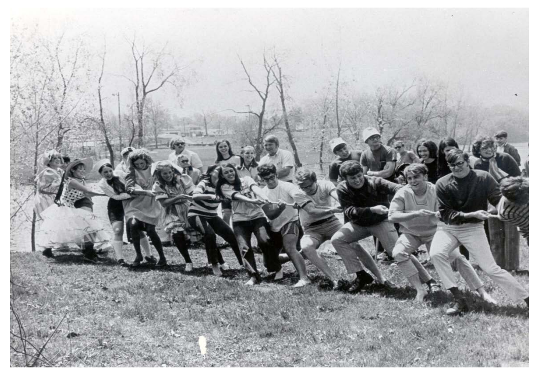
Working It Out!