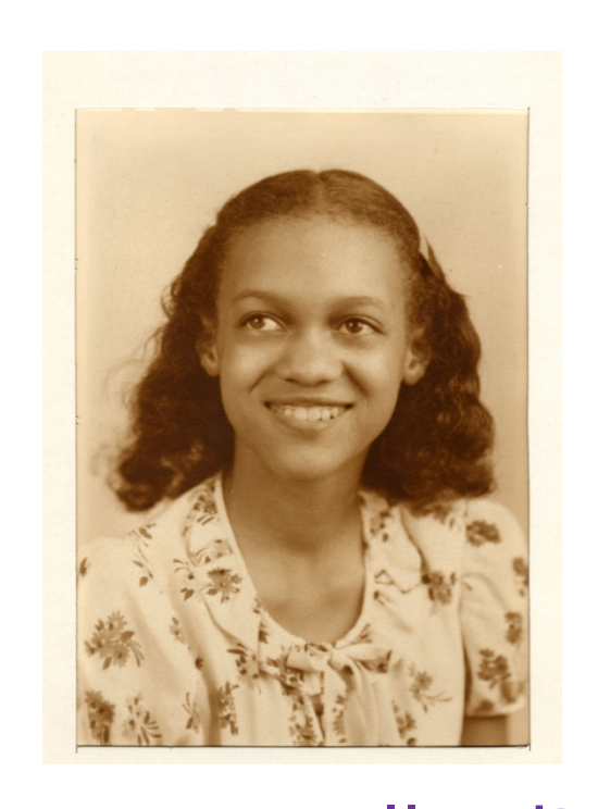
Imagine yourself here – a well-adjusted archivist!